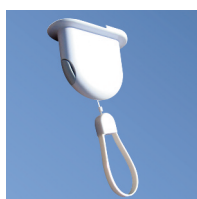
25-0042 ZipLine White

Easy-to-use loops are compatible with hole-punched substrates or graphic holders.