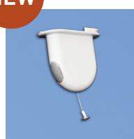
25-0042S ZipLine with Saucer White